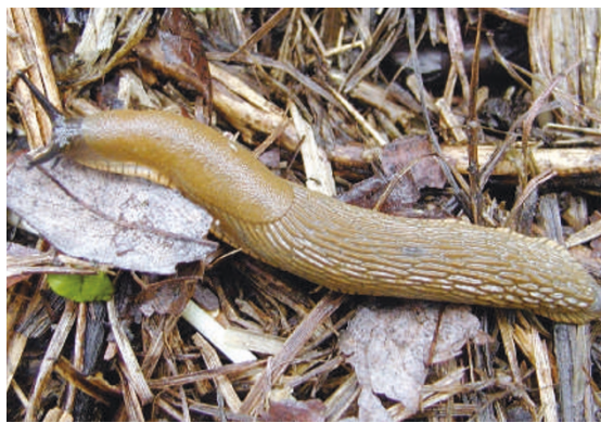
Figure 1 | Arion lusitanicus — conservation agent.

grassland sown with rye grass ( Lolium perenne ) and white clover ( Trifolium repens ) on a former arable field that contained its own residual seed bank of weed and other plant species.